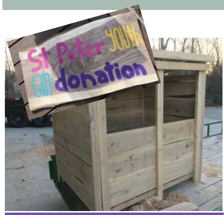
Bring on the Cans!! (NO glass bottles please) St Peter Youth that are attending the gathering are having a Can Drive. Keep all your cans for redemption and donate them to the bin in St Peter's Parking Lot. Thanks for supporting the youth at St Peter.